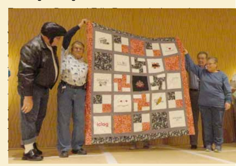
The Doubletoe Times Magazine of Clogging

Because the CLOG National Convention moves from year to year, activities are scheduled that give dancers the chance to enjoy an excursion together. Some time back, CLOG decided to add these excursions on Friday night coinciding with the fun dance. They have become very popular. This year's trip was to the historic Ryman Auditorium, the mother church of country music and original home of the Grand Ole Opry. While some remained at the hotel for the fun dance, three buses filled with cloggers headed to downtown Nashville. It was a great show in a stunning building.