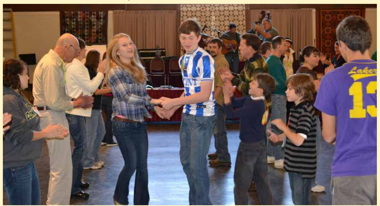
The Doubletoe Times Magazine of Clogging

For herself, she embraces the annual return to dance, having "interesting talks with people" and spending time with her sister, usually including a hike up the