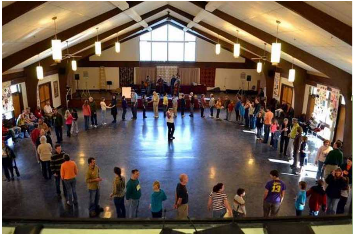
Photo Caption: Campers pair off for a big circle dance during a previous Bannerman Family Thanksgiving Dance Camp, one of myriad activities that occur during the four-day holiday weekend.