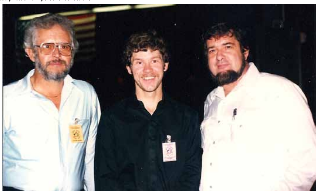
The Doubletoe Times Magazine of Clogging